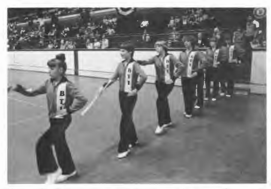
Members of the Belgium team are shown at the rehearsal of the Opening Ceremonies.