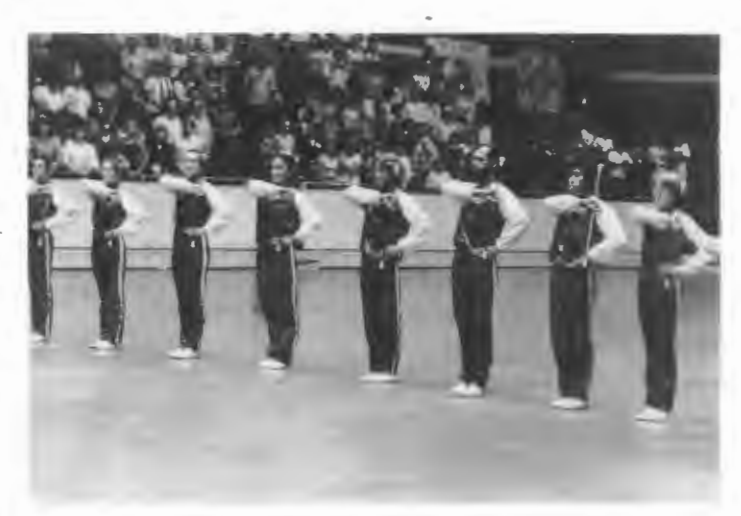
Members of the US team saluted during the playing of our National Anthem.