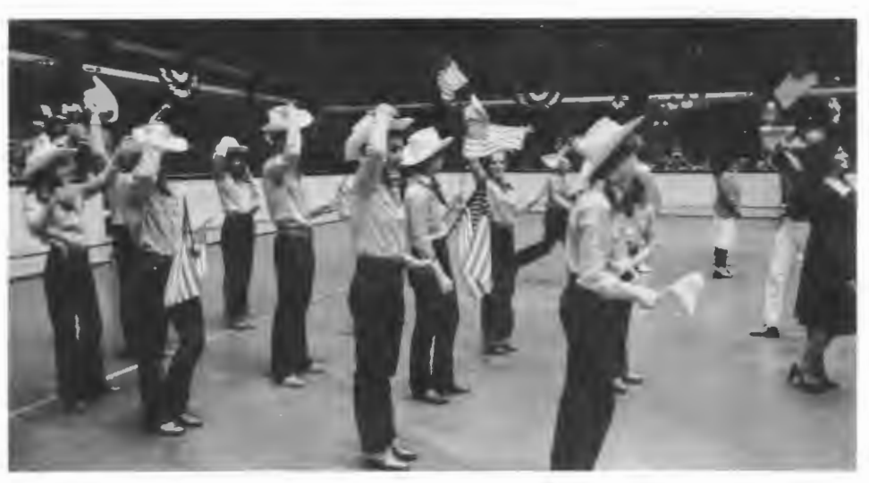
The U.S. Team members proudly waved the American flag in their brand new cowboy outfits.