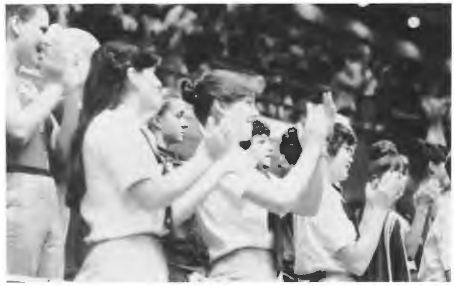
The audience was often on its feet applauding the performances of the world competitors.