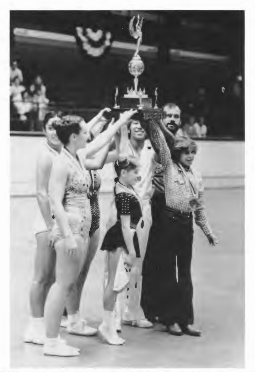
MEMBERS OF THE UNITED STATES TEAM PROUDLY RAISE THE WORLD CUP - presented to the team that accumulated the most points in the World Championships.