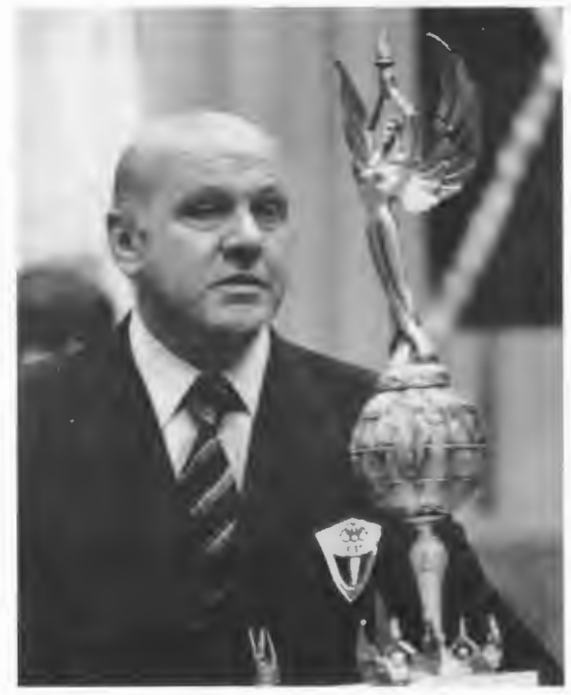
Peppino Giamminola, Italy, vice-president of the World Baton Twirling Federation, presents the World Cup to the United States.